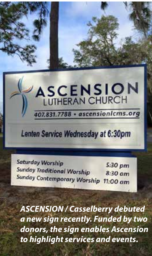
ASCENSION / Casselberry debuted a new sign recently. Funded by two donors, the sign enables Ascension to highlight services and events.