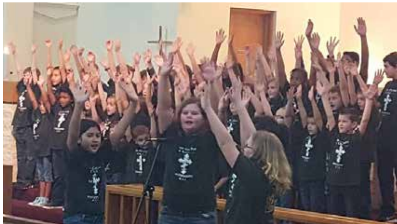
Above — First Lutheran / Clearwater — Singing and celebration were part of National Lutheran Schools Week at First / Clearwater.

Here is a sampling of District schools celebrating this special week.