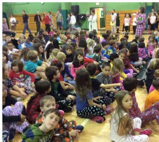
Right — Pajama Day and Talent Show were highlights of the weeklong celebration at Redeemer/Stuart . “We have a lot of VERY talented Rams!” was the conclusion.