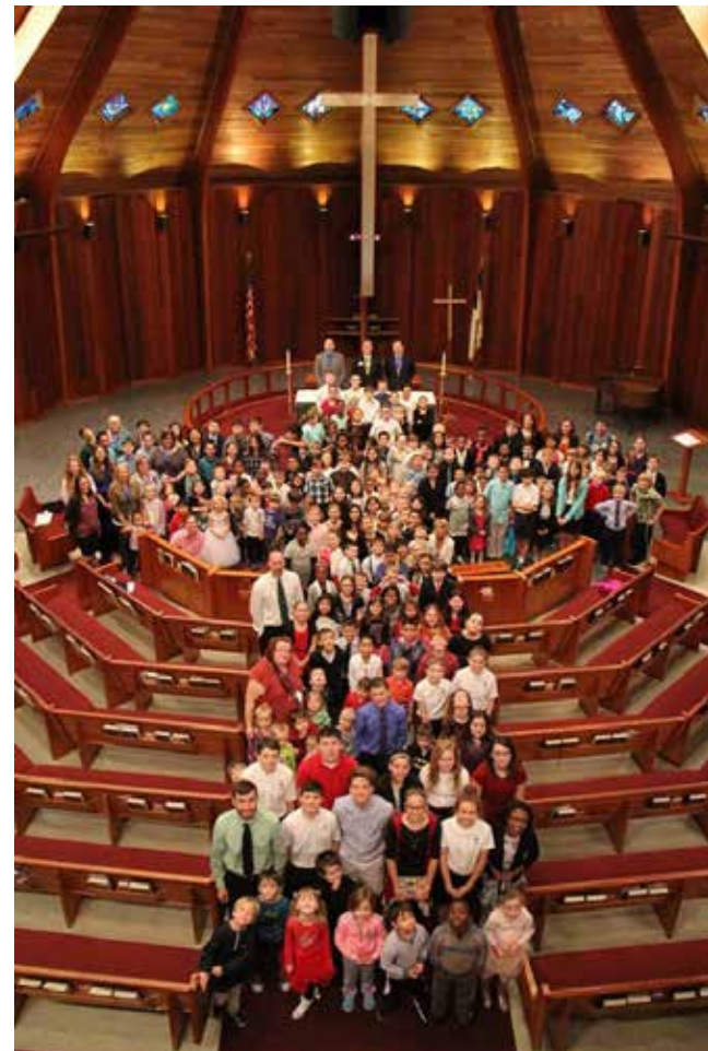
Above — Faith / Eustis — The student body at Faith concluded the week in chapel – gathering for a photo that emphasized that they are living together under the cross of Jesus.