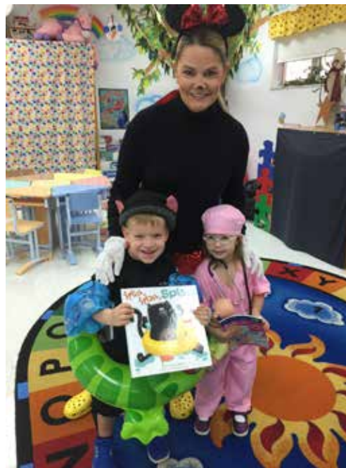
Below — Shepherd of the Coast / Fort Lauderdale enjoyed some wacky clothes and hair — providing an opportunity for student personalities to shine. Students also spent time during the week in service, making sandwiches for the homeless in the community.