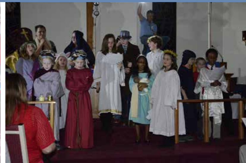
Savior of All / Cartersville was represented in the city's 2015 Christmas Parade with a parade featuring a nativity scene, lighted Christmas tree and church members. Later in the month, the Sunday School presented its Candlelight/Flashlight Christmas program followed by a congregational dinner. ■