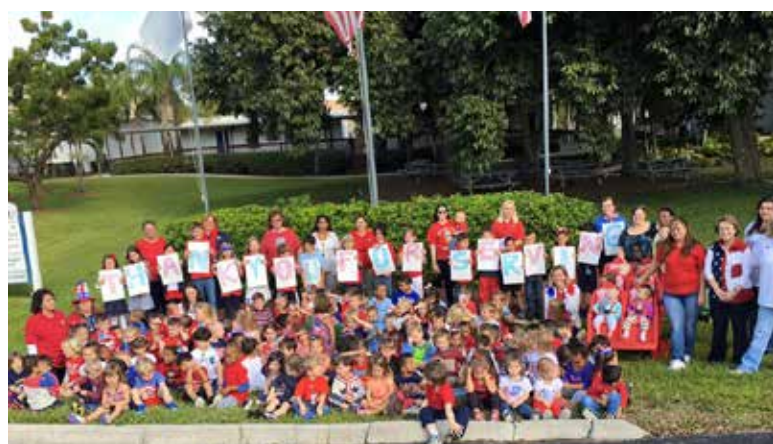
Above — Students at Gloria Dei Academy/Davie gathered for a group photo on Patriotic Day during National Lutheran Schools Week. The picture will be included in the care package being sent to a recently deployed Marine battalion.