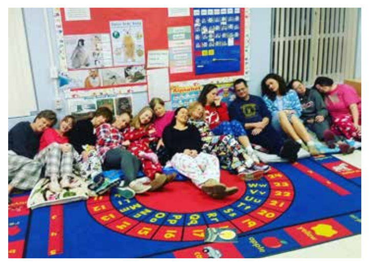
St. Paul/Peachtree City, GA: Pajama Day featured a teacher slumber party in the PreK3 room.

Nationally, more than 2,100 Lutheran schools serve 250,000-plus students in early childhood centers, elemen-