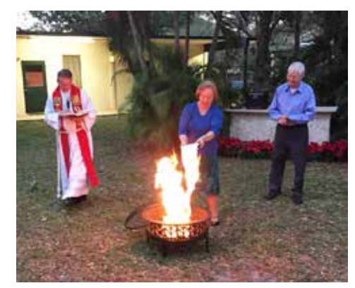
Part of the anniversary weekend at Immanuel included the burning of the mortgage.

Members and guests of Immanuel Lutheran of the Upper Keys began the February 11-12 weekend of celebrating the congregation's 50th anniversary by worshipping, singing God's praise and the burning of the