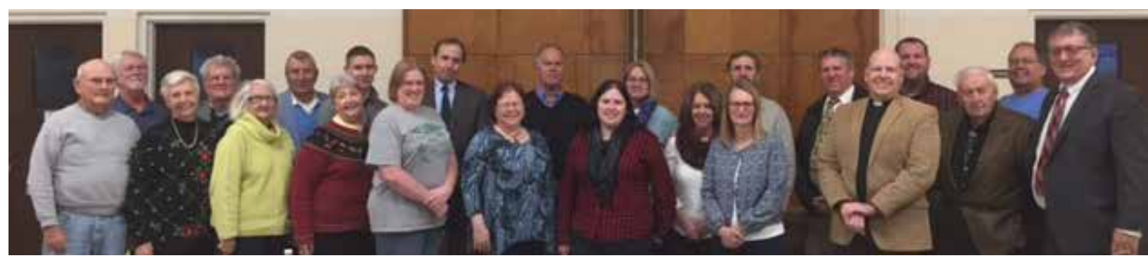
Some of the participants and speakers at the Multi Ethnic Symposium at Concordia Seminary/St. Louis