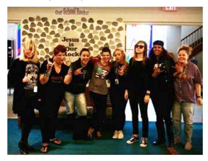
Holy Trinity/Tampa — Teachers got into the spirit of NLSW on "Rock Star Day."