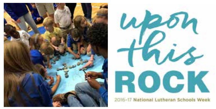
St. John/Ocala, FL — Students arts and crafts focused on the theme, Upon This Rock.

Shown here are some of the District school activities during the January 22-28 celebration.