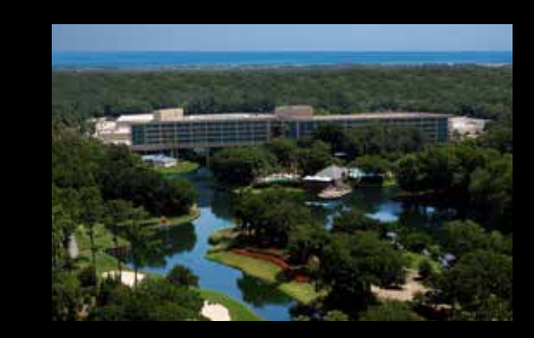
Marriott Resort Sawgrass Ponte Vedra Beach, FL

More information on speakers, breakouts and registration is coming soon. Visit our website for details: