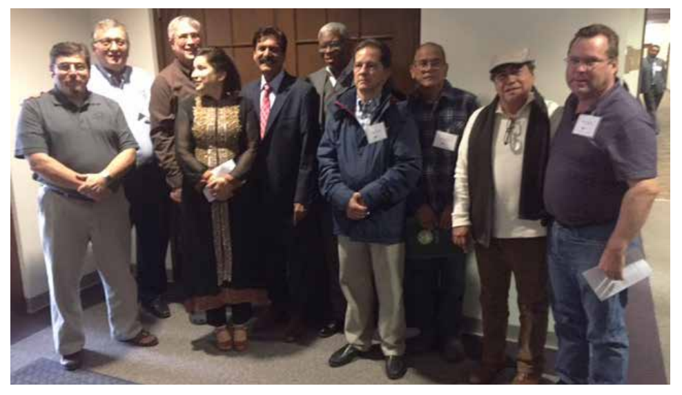
Participants at the recent outreach training event at First/Clearwater, which included prayer walking and canvassing, learning about iNeighborhood and Small Group models that support and help new visitors assimilate.