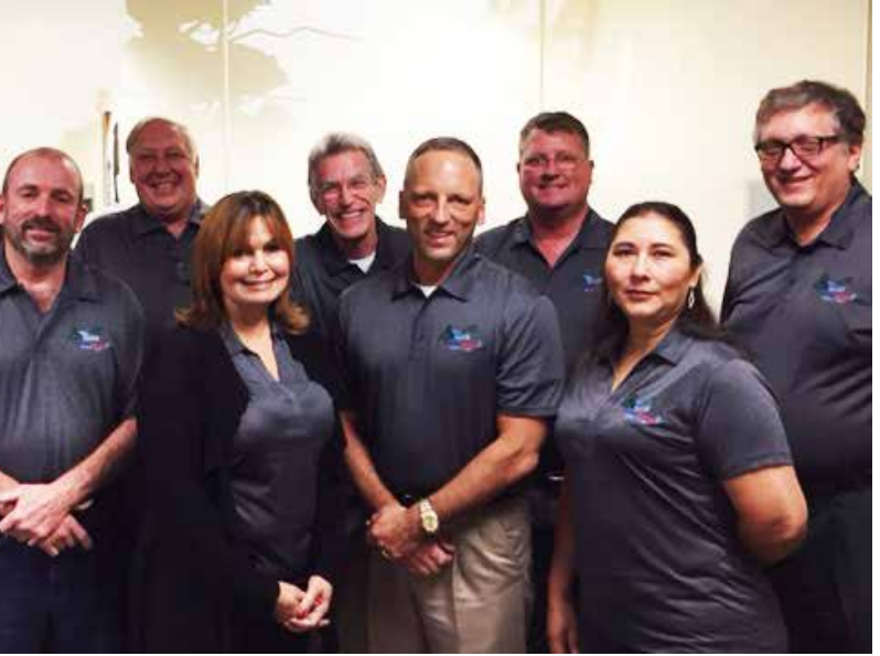
Members of the Florida-Georgia Mission Advisory Council

Check it out on Facebook (https:// www.facebook.com/ourTHRED) or visit the website at THRED.org for