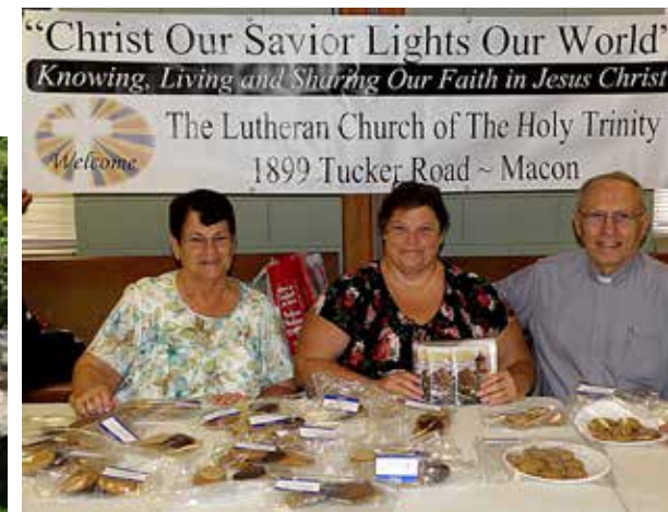
Members of Holy Trinity/Macon packed cookies to deliver to Florida evacuees staying at a local campground.