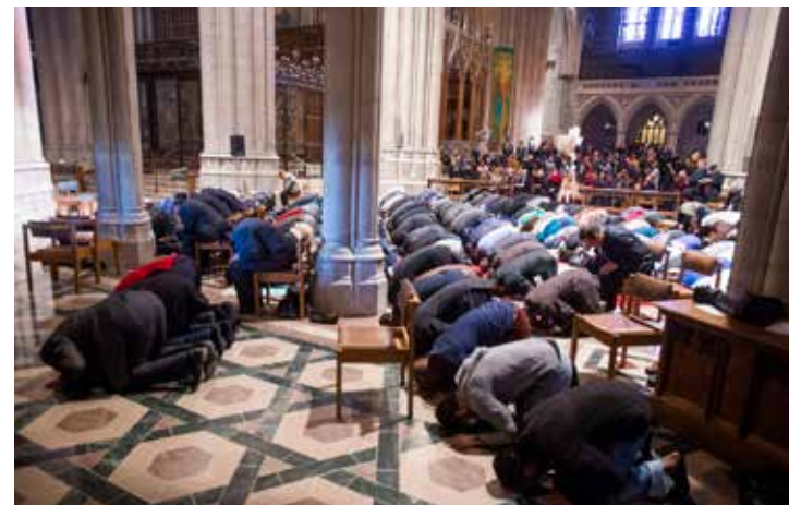
The Washington National Cathedral invited Muslims to lead their own prayers at the cathedral for the first time Friday (Nov. 14, 2014).

In November 2014, the Washington National Cathedral — our country’s iconic Christian “house of prayer” — was the venue for just such an interfaith event. The Muslim community was invited to offer prayer to Allah. Prayer carpets were arranged diagonally so the Muslim worshippers