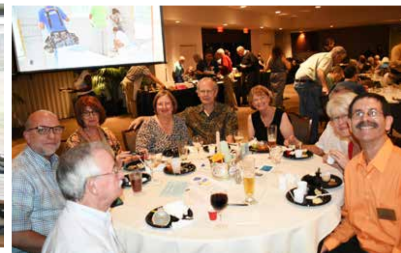
Above — Rivercliff Lutheran/Sandy Springs hosted its annual Taste of Habitat this past September 25. The event raised more than $25,000 — an all-time high.