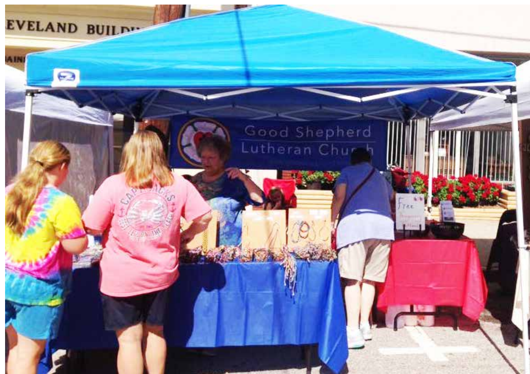
Members of Good Shepherd/Gainesville were part of Mule Camp Market 2017, a local fall festival and craft exhibition. The annual three-day event held in October draws crowds of up to 75,000. Good Shepherd hosted a booth featuring colorful handmade jewelry, with all proceeds going to efforts to stop human trafficking.