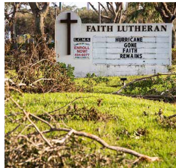
The sign at Faith Lutheran/Naples on September 13 was surrounded by Irma debris.