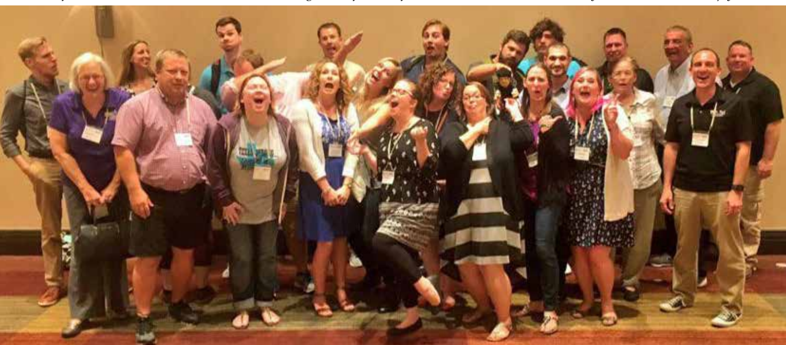
Taking a break from Conference events ... District DCEs and youth leaders share their joy.