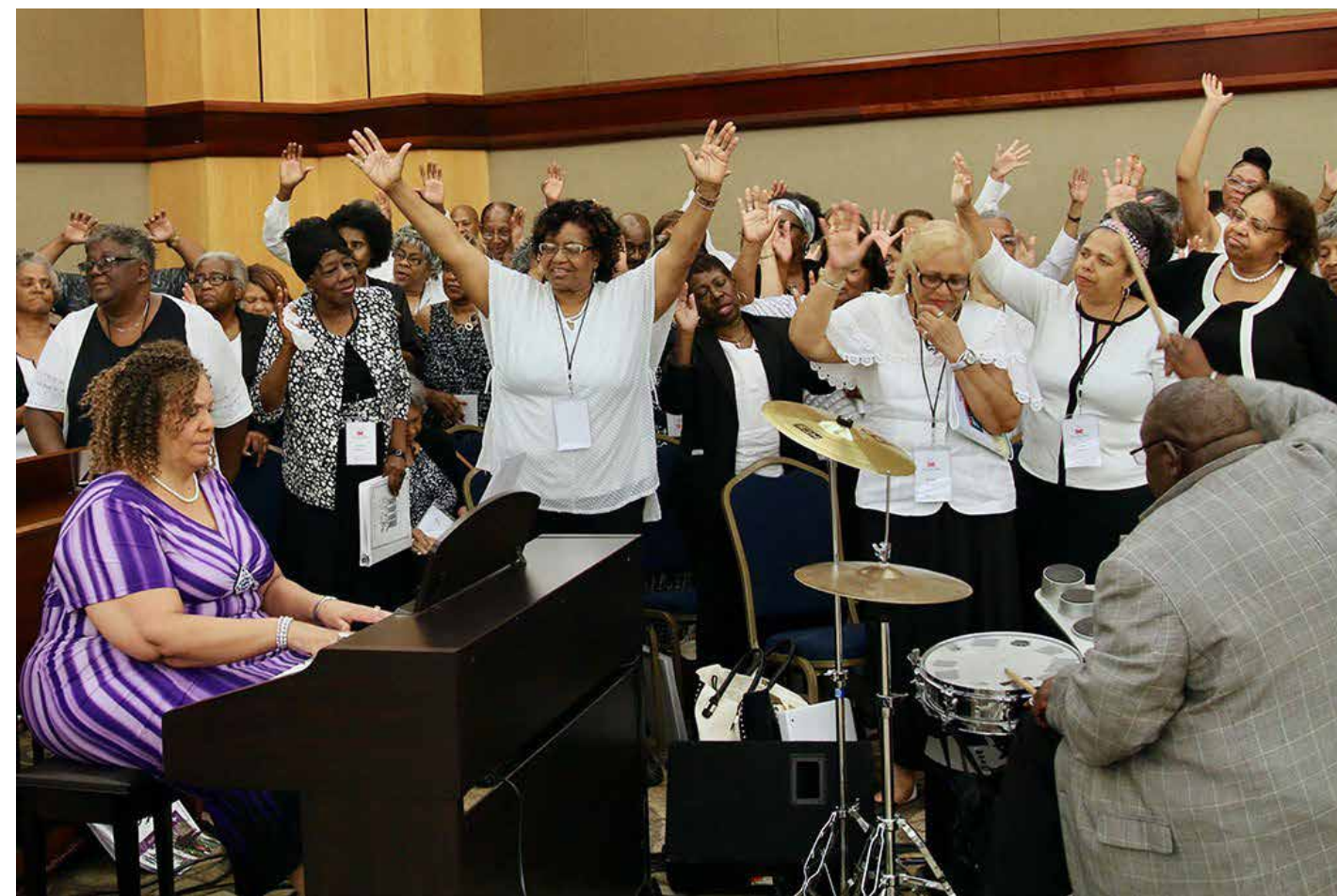
The mass choir, composed of church members from all over the country, sang during the LCMS Lutherans in Black Ministry Family Convocation