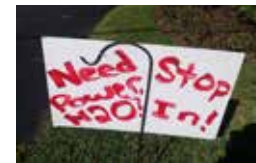
Messiah/Tampa opened their doors to the community offering power and water — and a cool place to just rest. The congregation's Disaster Response Ministry went into the community and cleared some downed trees.