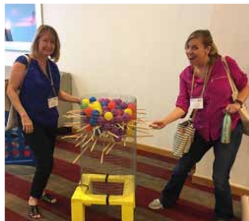
This interactive booth/display was a popular stopping place for PEC participants.