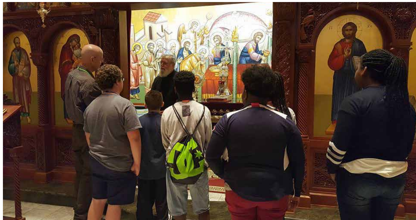
VBS Field Trip (above) — On the agenda for the middle school groups in the Trinity/Savannah Vacation Bible School was a trip to St. Paul's Greek Orthodox Church. The church was built as an opera house in the 1800s. Sundaes and discussions of the day and week followed the tour.