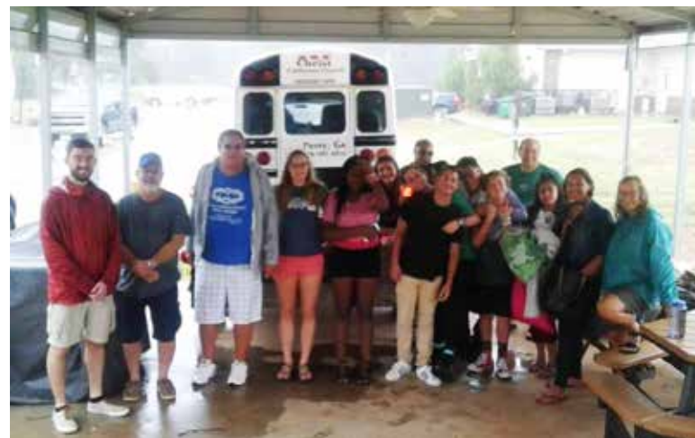
Sixteen members of Christ Lutheran/Perry were among the 50 participants in the recent Gulf Shores Servant Event. After daily devotions, Camp Dixie Lutheran activities included painting a house, repairing a trailer, installing soffit, repairing shelving units, picking up branches in the woods and a dozen other projects. The youth also enjoyed canoeing, kayaking, time at the beach, board games, and more.