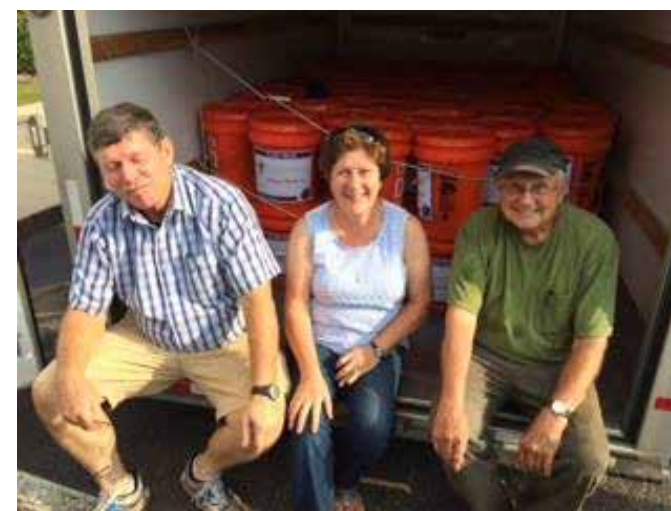
Members of Our Redeemer Lutheran Church/Augusta filled 102 flood buckets that in mid-September were ready to be sent to Florida to assist those recovering from Hurricane Irma.