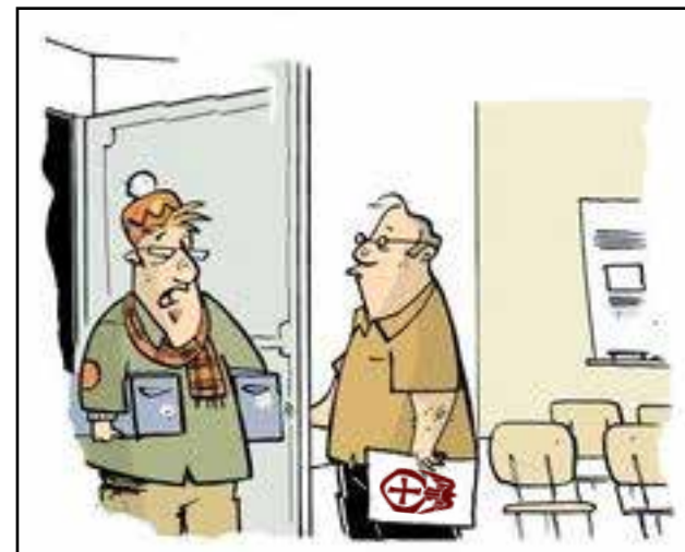
“Volunteer? Pastor I thought you said to come over and bring beer!”

It can be frustrating! Then after a while an existing leader may even get a bit of a chip on their shoulder and conclude that no one wants to help! That might be one conclusion, but another insight might be that the current way of recruiting others isn’t working. In last issue’s article we talked about how to pick leaders. In this article we will talk about recruiting leaders.