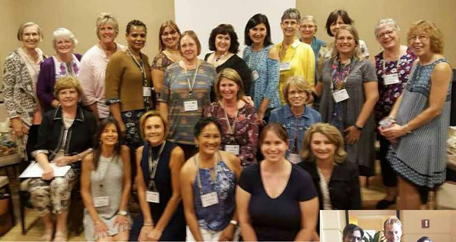
Pastors' wives gathered for a photo at the PEC.