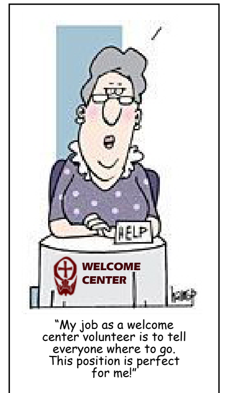
“My job as a welcome center volunteer is to tell everyone where to go. This position is perfect for me!”

Follow these steps intentionally and you will be surprised how many new people will serve. Contact me and let me know how I can serve you as you recruit others. ■