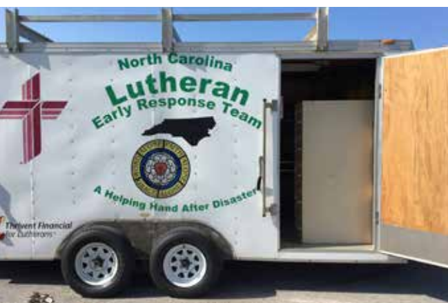
The Florida-Georgia District was able to help North Carolina last year with their flooding disaster. The favor was returned this year.