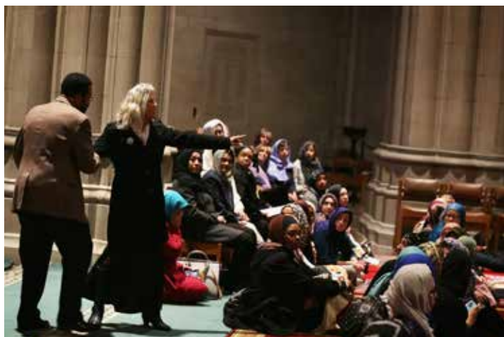
An unidentified female heckler briefly interrupted the Muslim prayer service, shouting, “America was founded on Christian principles. ... Leave our church alone!” She was quickly removed by security.

Fearless, gentle and wise, we must imitate Paul who said, “I am not ashamed of the Gospel, because it is the power of God for the salvation of everyone who believes: first for the Jew, then for the Gentile” (ROMANS 1:16). And that includes the Muslim. ■