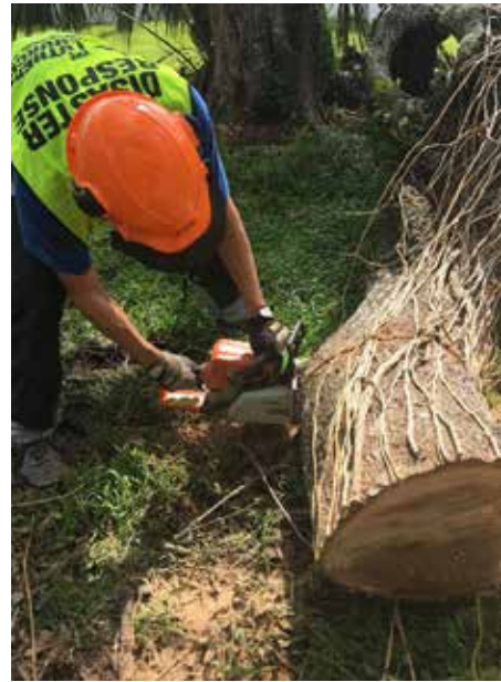
Dedicated volunteers spent hours cleaning up the campus of Christ the King/LaBelle.

H urricane Irma barreled through Florida and Georgia on September 10th and 11th wreaking havoc and destruction in many places. As bad as the storm really was, loss of life was minimized by people who