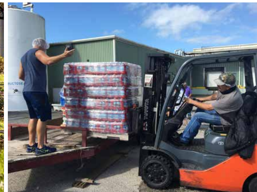
Volunteers working to unload and transport the 25 pallets of water and supplies that came to the District from Immanuel Lutheran Church in Manchester, NH.