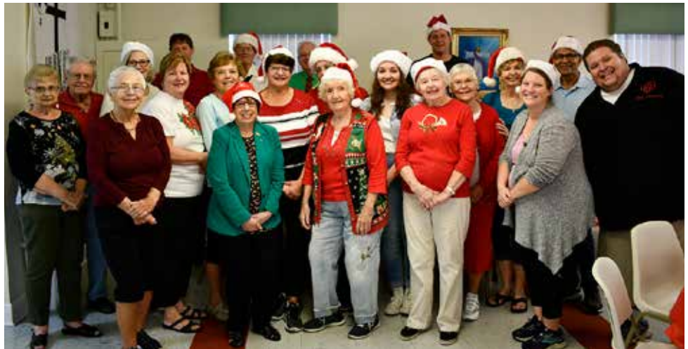
Lutheran Church of the Redeemer's Volunteers at Breakfast with Santa