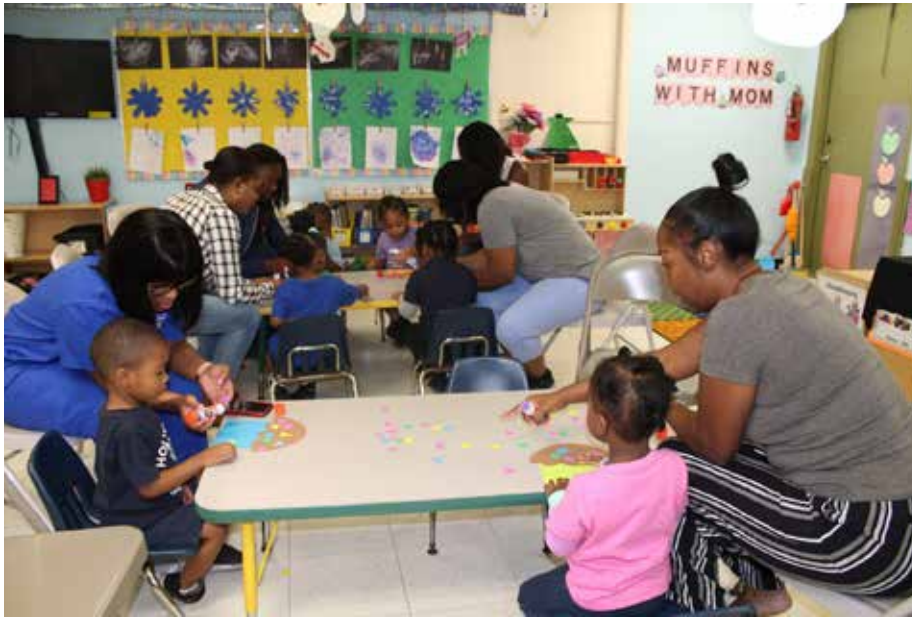
Holy Cross/North Miami, FL kicked off the new year with their PK2 hosting "Muffins with Mom." It enabled moms to enjoy a breakfast treat, time with their kids, some hot coffee, and some quick fun before heading off to work.