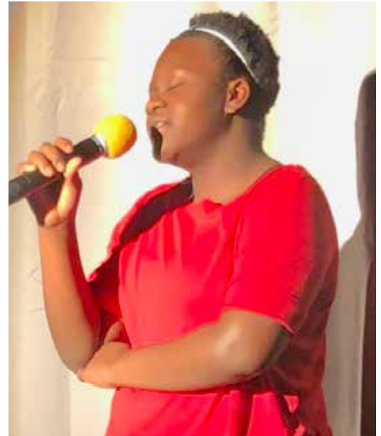
Our Savior/Orlando, FL produced "Christmas Hope" — a skit based on a contemporary story of a family who had lost their husband/father. The widow and her children are overwhelmed — trying to deal with getting through Christmas. They work together to recall the Christmas story of salvation in Jesus Christ.

Every January Concordia University/Mequon's Symphonic Wind Ensemble embarks on a week-long performance tour to various locations across the United States and abroad. This year's tour took them into the greater Tampa, FL area and they were hosted at Grace/Winter Haven, FL . The evening concert included sacred and classical music from the standard wind repertoire. In the morning they performed for the students, and then combined with the middle school band for some pieces and solo and ensemble work.