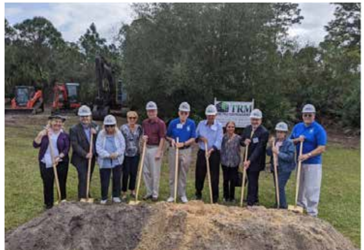
Members of TRM Construction Management, the city and the congregation participated in the January groundbreaking.