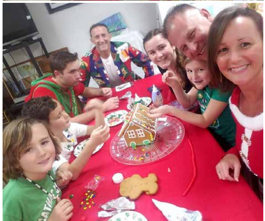
Immanuel/Tavernier, FL had a new event this year before their Christmas Eve service. A young family in the church volunteered to host and provided gingerbread houses to be decorated and a variety of homemade desserts.