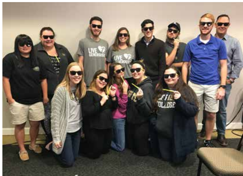
More information about LiveUCF is on their website: liveucf.com . If you know of any students headed to University of Central Florida, LiveUCF would like to connect with them. Send information via email to connect@LiveUCF.com .