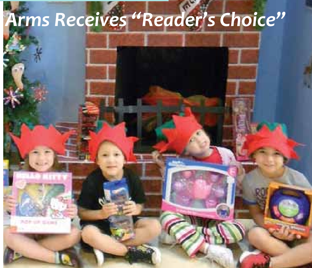
Students at Open Arms Preschool show off some of the toys collected for the WPSL Christmas Kids Toy Drive.

Open Arms of Fort Pierce serves children from the ages of six weeks through five years. After-school care is available for elementary school age children. ■