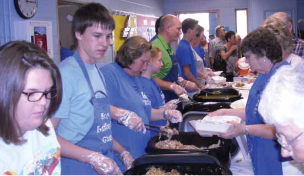
Hope's youth serving up the Turkey Supper to arriving guests.

In the aftermath of Hurricane/ Superstorm Sandy, members of Hope-Plant City used their 18th Annual Turkey Supper to help bring relief.