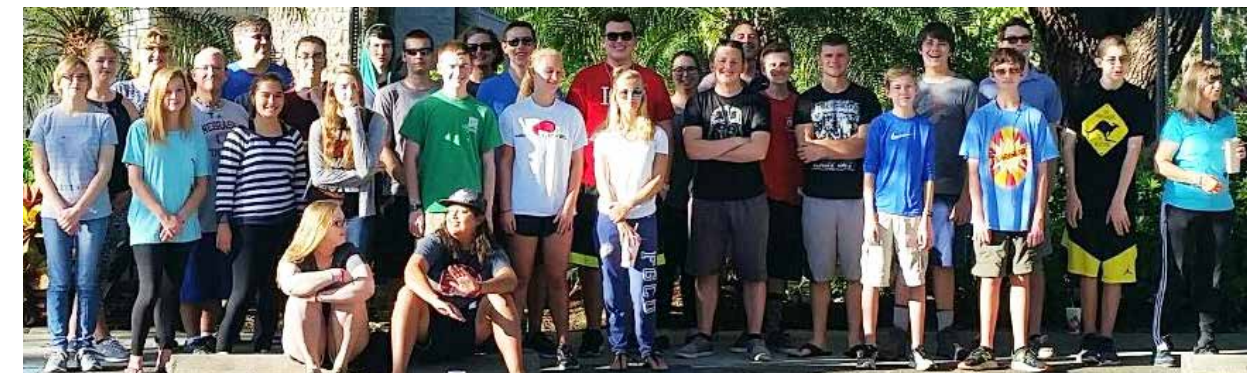
Sarasota was represented at the Gathering by youth from Concordia and Beautiful Savior.