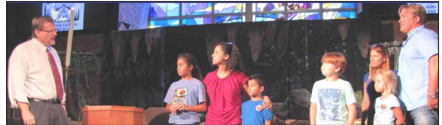
VBS at St. John/Ocala ended on July 29 with a celebration as four children and one adult were baptized into the Christian faith during the closing session. The week's theme was Cave Quest.