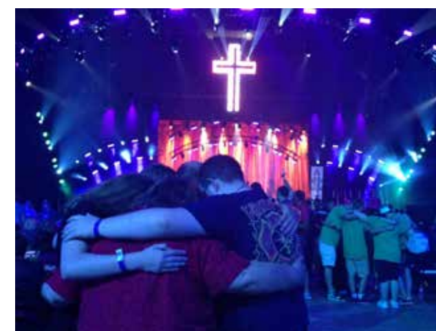
Uplifting worship with more than 22,000 other teens and adult leaders from across the globe was a Gathering highlight