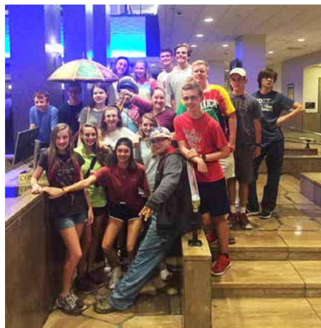
The group from Grace/Jacksonville celebrating their arrival in New Orleans.