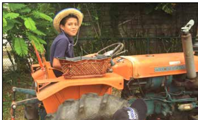
VBS 2016 was a "farmtastic" time for all at Our Savior/Lake Worth.