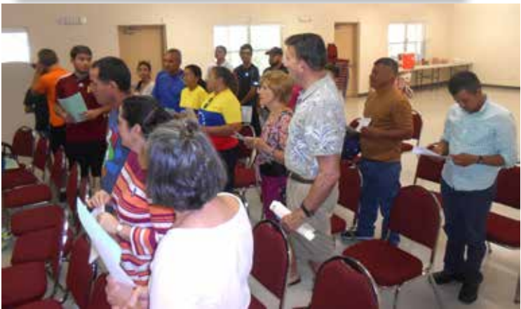
Worship at Golden Gate Pelican Community Center & Church

Of the many names being placed over Christ's Church these days, in Naples there is one that is not just “unique” or “cool” but also historical, relevant to the culture of SW Florida and provides a direct connection to Christ! Welcome to the Golden Gate Pelican and The Pelican Lutheran Church of Naples!