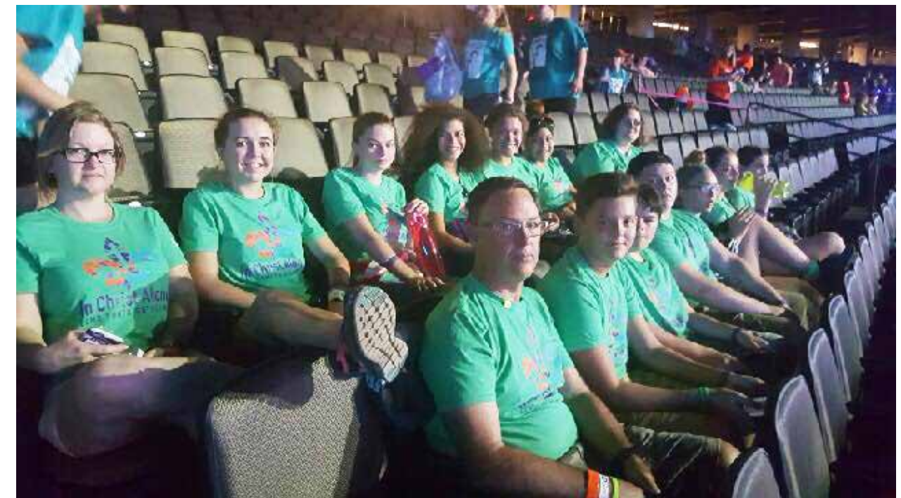
Teens and counselors from Ascension/Casselberry preparing for the final National Youth Gathering mass event. The four NYG mass events featured acclaimed speakers, musicians and performers.