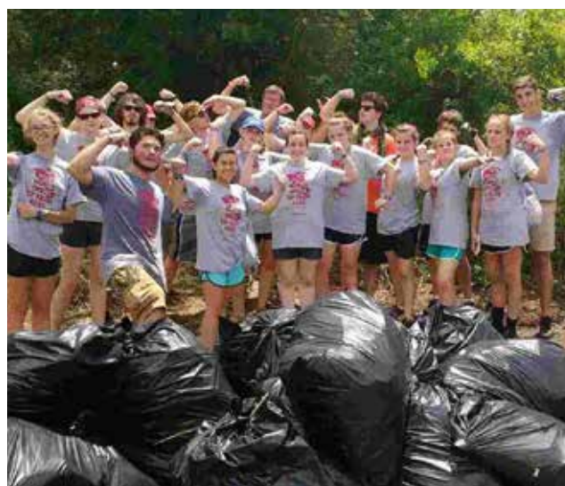
The Faith/Marietta team completing their service work project at the NYG.