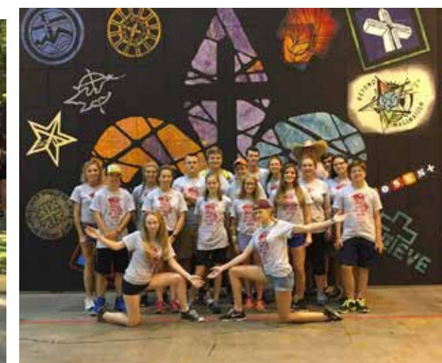
Grace/Naples youth inside the Mercedes Benz Superdome.