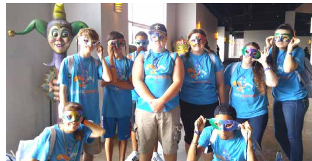
St. John/Ocala youth model the Mardi Gras masks they made at the District NYG event.