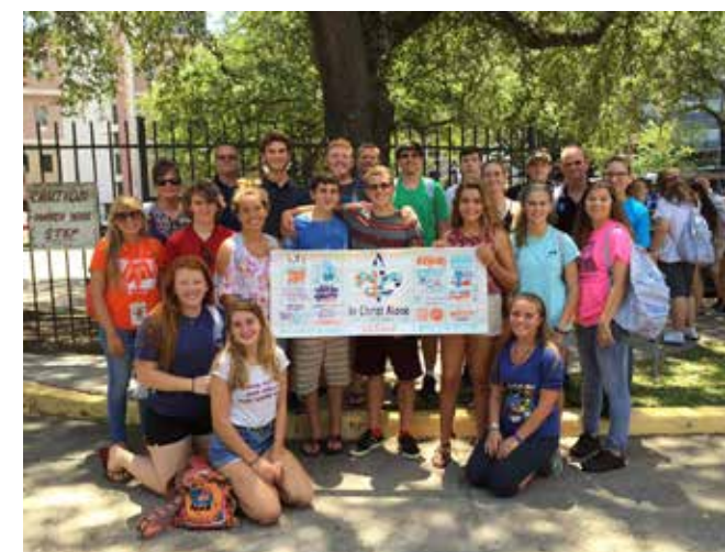
Woodlands/Montverde youth getting ready to leave New Orleans after the final worship service in the Mercedes Benz Superdome.