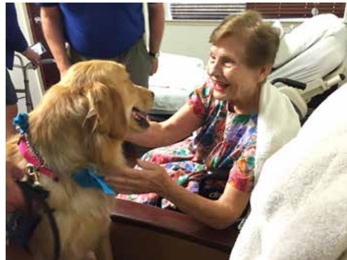
Lizzie's first visit to a Trinity member at a nursing care and rehabilitation facility in Savannah.

On August 24, a dog arrived at the Savannah/Hilton Head Airport. This was no ordinary dog; it was Elizabeth – the first Lutheran Church Charities (LCC) Comfort Dog being delivered to a congregation in the Florida-Georgia District.