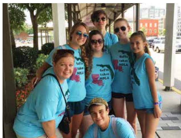
Faith/Fort Lauderdale teens on the streets of New Orleans with their counselor.