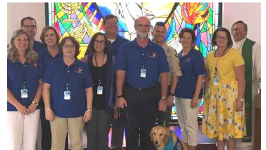
Lizzie became a member of Trinity/Savannah during Passing of the Leash ceremonies on Sunday, August 28. A blessing was given over Lizzie, and the Comfort Dog Handlers were installed as the Comfort Dog Ministry became official.