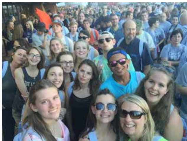
First/Gainesville contingent taking a photo break.