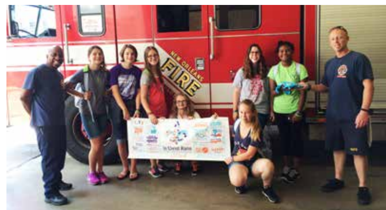
Amazing Grace/Oxford youth visited the NOLA fire department to deliver a huge container of homemade cookies in appreciation of their service.