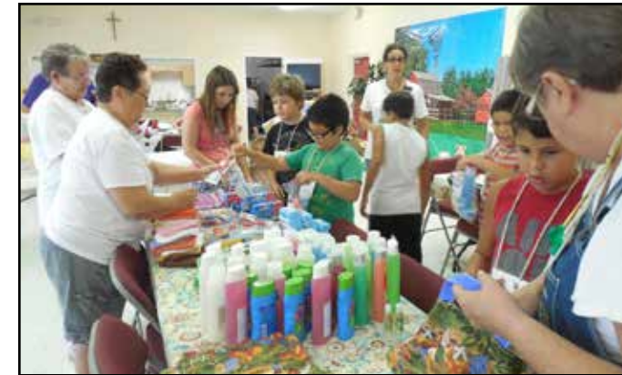
Hope Lutheran/Hudson was transformed into a Barnyard Roundup for its July 18-22 Vacation Bible School. Part of the week's activities included making care kits for the needy with the help of congregation members.