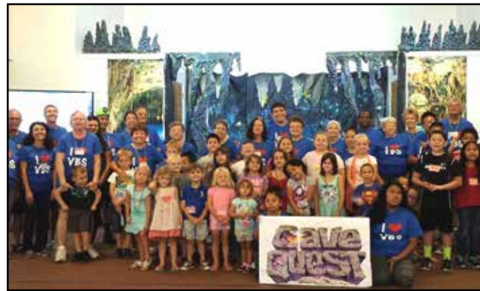
Cave Quest was the theme for VBS at Bethlehem/Fort Myers. Shown here are the students and congregation members who participated in the event.