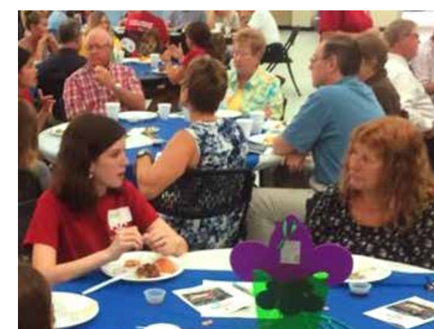
Once back in Florida, youth from St. Paul/Lakeland hosted a breakfast for congregation members to thank them for their support.