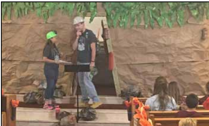
Vacation Bible School at St. Paul/Boca Raton focused on the theme "Cave Quest."