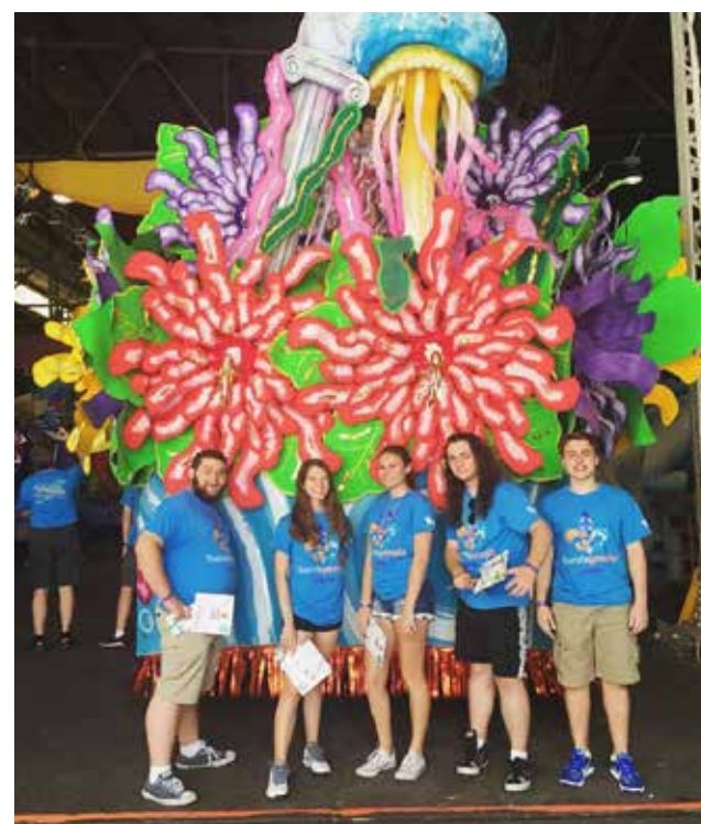
Trinity/Orlando youth at Mardi Gras World.