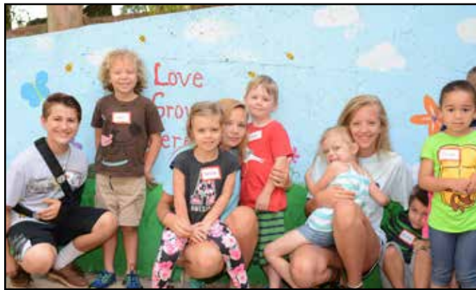
Timothy Lutheran Church/Woodstock invited members and the community to Cave Quest VBS from June 13-17. Some 112 children — preschoolers through students completing 5th grade — enjoyed a week of "Following Jesus the Light of the World." Each day the students explored the rock solid foundation of Jesus' love.