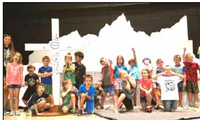
VBS was a week full of music, games and more at First Lutheran/Clearwater. The theme was EVEREST: Conquering Challenges with God's Mighty Power!