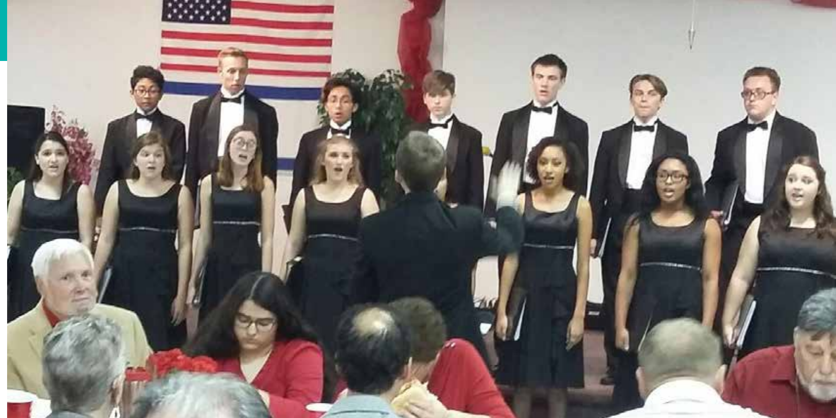
Faith Lutheran/Sebring celebrated the 500 th Anniversary of the Reformation on October 31 with a worship service and German themed dinner following. More than 240 people attended this event, along with pastors from the Heartland Circuit. Guests were entertained during the dinner by The Sebring Show Choir. ■