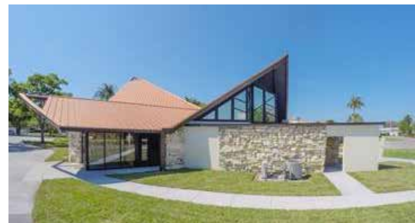
Christ the King/Largo, Florida

"Our focus is to always turn limited resources into unlimited ministry.