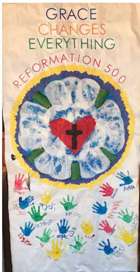
Immanuel Church and School/ Brandon is celebrating the 500 th Anniversary of the Reformation throughout the school year. The theme for the year is the same as that from the LCMS Reformation logo, "It's still all about Jesus." The classroom doors were decorated in October for Reformation Sunday and the celebration that the church is hosted after the service on October 29. One of the door decorations is shown here. ■