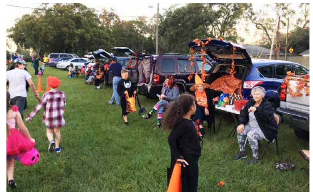
Right: Festively decorated cars filled a grassy area of the Our Savior/Zephyrhills campus for the annual Trunk or Treat event. Trick or treaters went from trunk to trunk for goodies, which were distributed by members of all ages. ■

Capping the day was a school photo taken around the chalk colored Luther Rose on the outdoor basketball court. Third-grade students drew and colored the cross and heart in the seal; seventh-grade students finished up with coloring the rose, the blue background and golden rim. ■