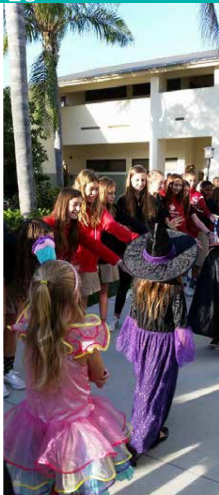
Trinity Church & School/ Delray Beach students had the opportunity to dress in costume and parade around the campus on October 31. The annual Halloween parade is a favorite fall activity. ■