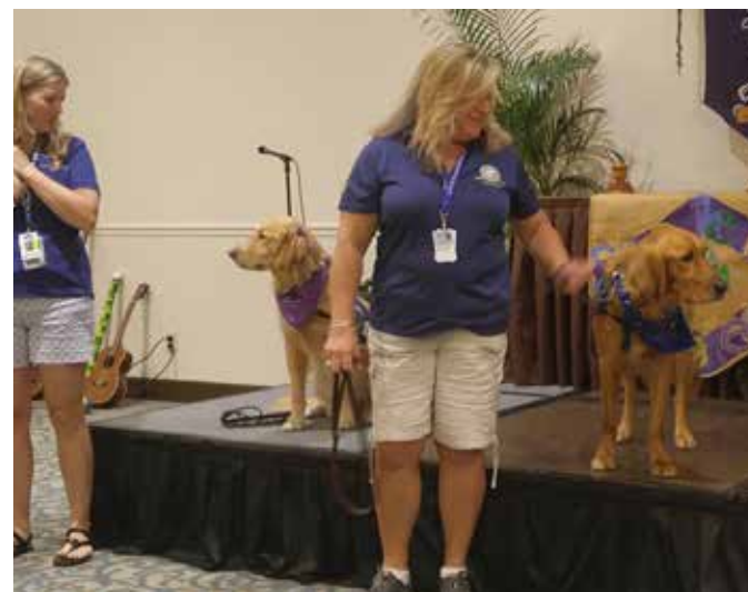
Comfort Dogs Lizzie and Luke were special guests at the Florida-Georgia District retreat in September on Jekyll Island, GA.