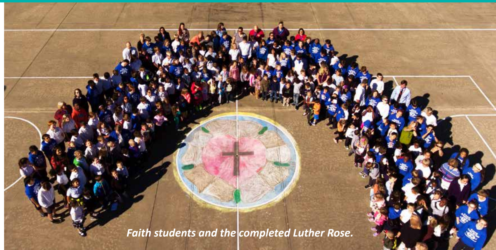
Faith students and the completed Luther Rose.