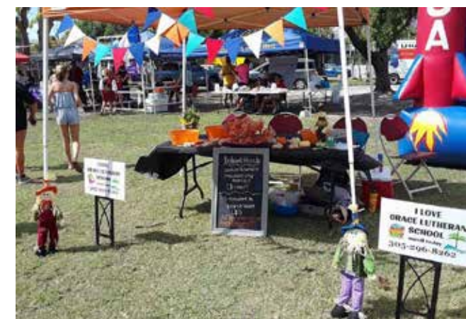
Above & below: Children's Day 2017 in late October was a major success at Grace Lutheran School/Key West. Members volunteered time and baked goods. ■