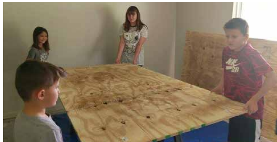
The Lutheran Church of the Cross/Port Charlotte Our Youth Group has been working on the congregation's Christmas in the Park project for several months. The finished work is on display in the Cross Monument Prayer Park through the Advent season. ■