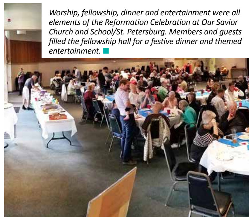
Worship, fellowship, dinner and entertainment were all elements of the Reformation Celebration at Our Savior Church and School/St. Petersburg. Members and guests filled the fellowship hall for a festive dinner and themed entertainment. ■