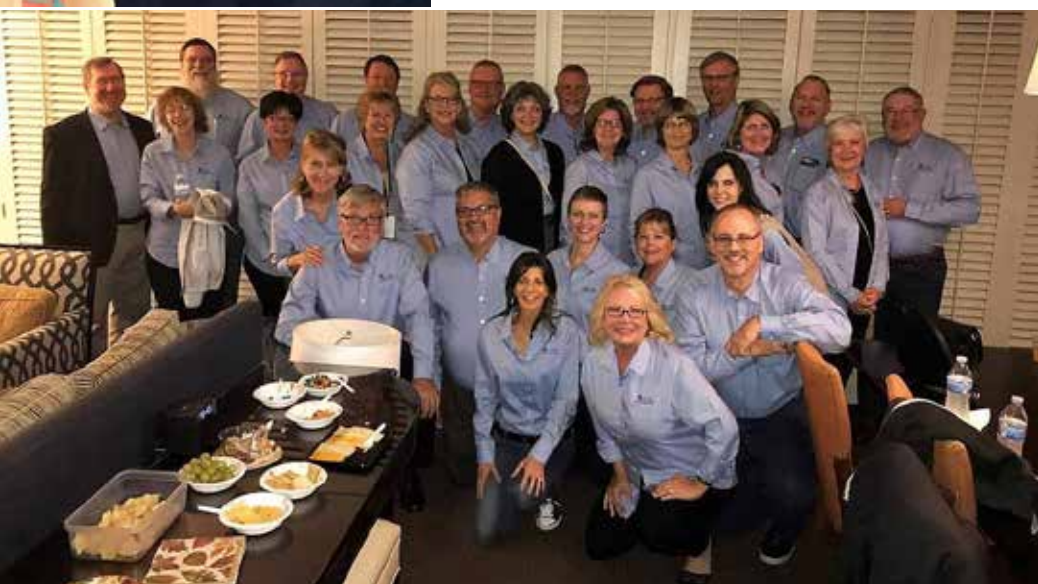
The Florida-Georgia District contingent at the annual conference.

"If you're afraid to get out of your comfort zone, you cannot achieve the unachievable. If you're afraid to get out of your comfort zone, you cannot love boldly," speaker Herman Cain told conference participants.