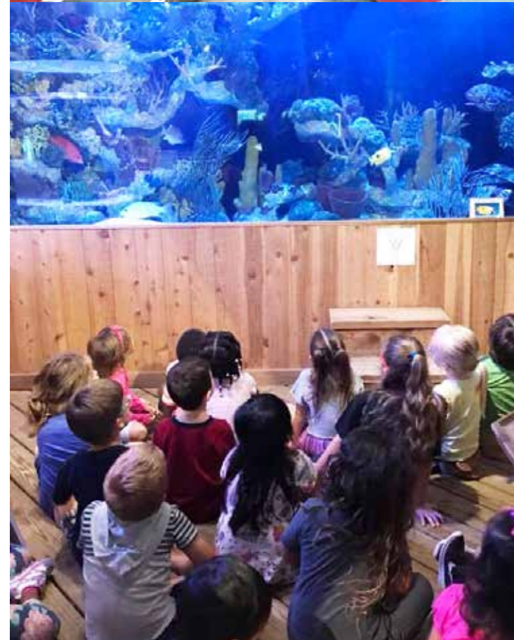
In early November VPK students from Faith Church & School/North Palm Beach went to the Loxahatchee River Center. They learned about nocturnal and diurnal fish, how some fish live in saltwater and others in freshwater. They designed their own fish and even got to touch some fun creatures. The highlight of the visit was getting to see a baby gator. ■