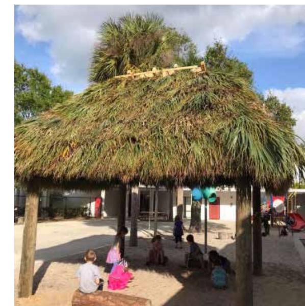
Faith's new Tiki hut was completed to allow the children a shady spot in the sand on the playground..

and a multi-purpose building was constructed. The Frank E. Michel Family Life Center has a gymnasium, kitchen, multipurpose room, library and four classrooms. It can also be used as a shelter for the community when times of emergency. Groundbreaking services for the Frank E. Michel Family Life Center were held on December 3, 2006 and the building was dedicated on December, 30 2007. ■