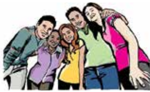
Young Adult Groups

They aren't interested because in today's world, going to church is not just optional but odd. In other words, it is not the norm for people to attend church on Sunday. Most statistics show far fewer than 20% of the population attending church on Sunday. Yet while church attendance is down, studies also show