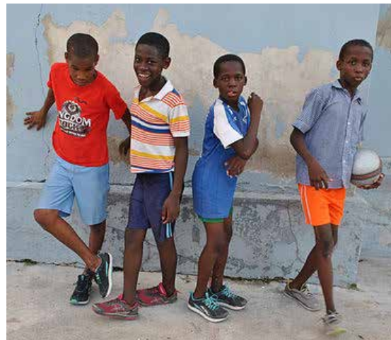
Above — Students at Holy Cross School/ North Miami were challenged to raise $2,000 in chapel offerings in December as a special offering for Good Shepherd Orphanage in Carefour, Haiti.

The students met that goal — and the funds were wired to the orphanage in late December.