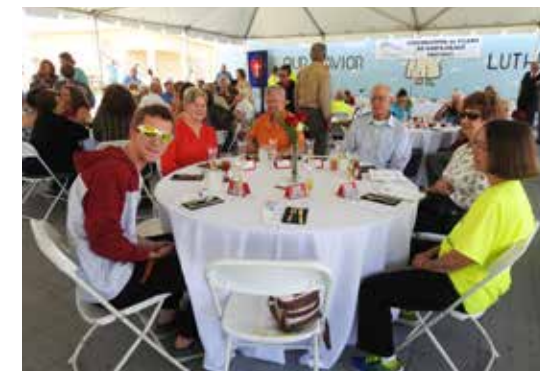
Members and friends came together for a celebration anniversary dinner under a tent on the site of the former sanctuary.