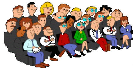
Community Guest Speakers

A logical idea is to say we just need to invite people to church. That's what we did in the past. Maybe you remember friendship Sunday, special guest speakers/preachers or special sermon series or music where you hoped