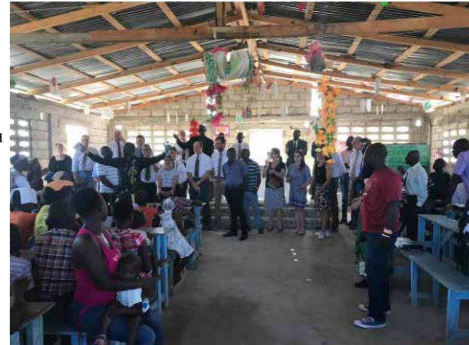
Worship on Sunday with the local community.

Mission: Haiti has been working in Haiti since 1999. The organization is dedicated to the long-term success of the Haitian people and has various projects under way throughout the year. More information is available on Facebook or at missionhaiti99.com. To get involved, make a contribution or donation, sponsor a project or inquire, please email missionhaiti99@aol.com. ■