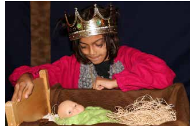
Trinity Lutheran/Downtown Orlando hosted a free photo booth at the city’s Christmas Tree Lighting event. The interactive manger photo booth was one of several tents hosted by Trinity. ■

The youth of Faith/Merritt Island led an Advent worship for the congregation during the 2017 Christmas season. The 6 th -12 th grade students taught the congregation about the Advent Wreath with a vocal, violin and trumpet solo. ■