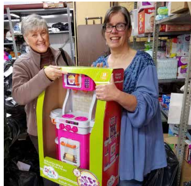
St. Peter/Dahlonega members went shopping for toys in December to contribute to the White Christmas program of Community Helping Place. Thrivent Financial provided an action team grant that the congregation more than doubled to use for the shopping. ■