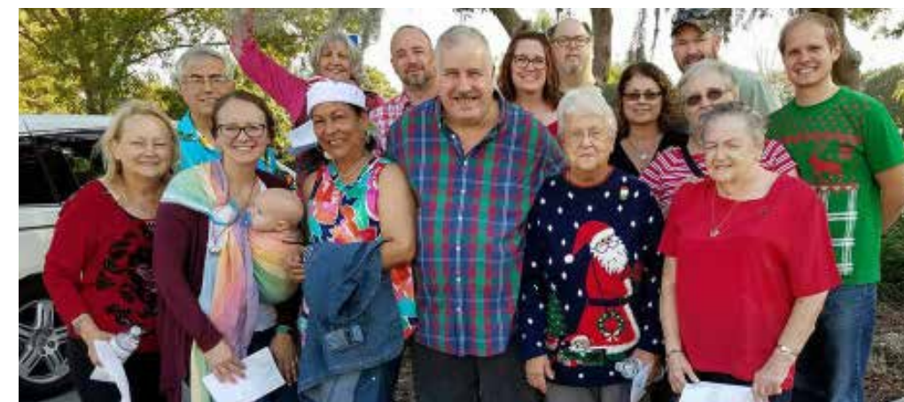
Members of Our Savior/St. Petersburg spent one Sunday afternoon in December taking Christmas joy to the community. A group of volunteers singers went Christmas caroling at the East Bay Rehabilitation Center.