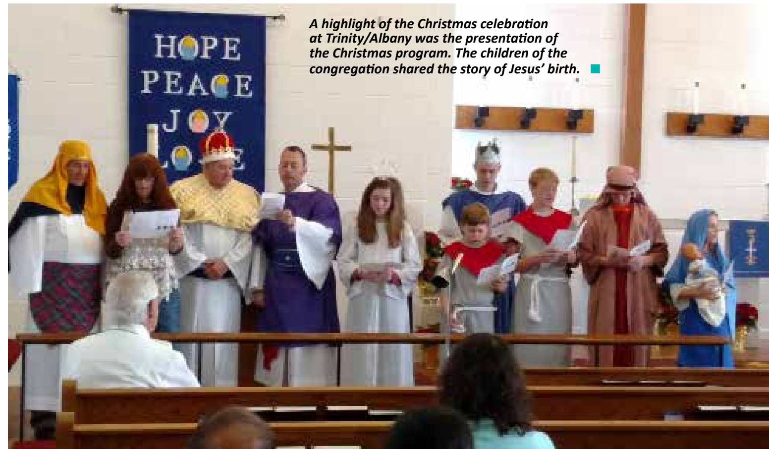
A highlight of the Christmas celebration at Trinity/Albany was the presentation of the Christmas program. The children of the congregation shared the story of Jesus' birth. ■