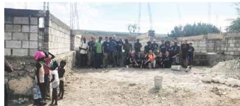
The team that helped complete the school building.