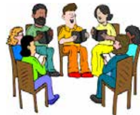
In-Home Bible Study Groups

Then as relationships develop, as spiritual conversations are on the rise, an invitation to celebrate the resurrection of Jesus on a Sunday morning is certainly appropriate. Perhaps even a baptism is in order!