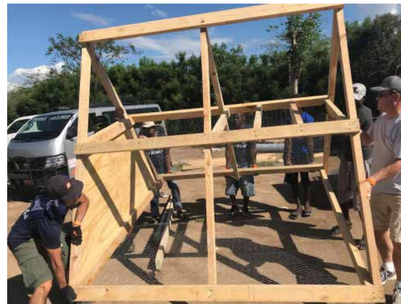
Working on the chicken pens.