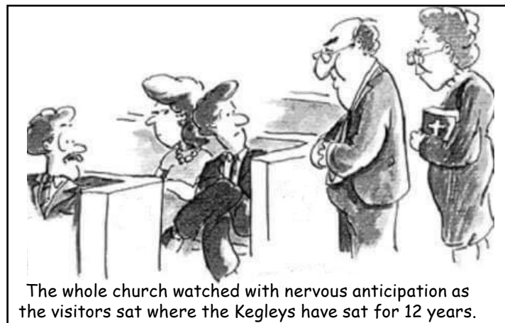
The whole church watched with nervous anticipation as the visitors sat where the Kegleys have sat for 12 years.

370 W. Camino Gardens Blvd. Suite 101 Boca Raton, FL 33432 James.Franskousky@LPL.com www.private-wealth.us