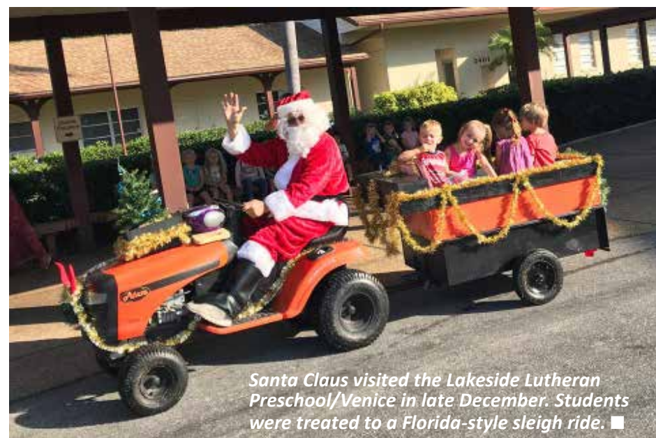
Santa Claus visited the Lakeside Lutheran Preschool/Venice in late December. Students were treated to a Florida-style sleigh ride.