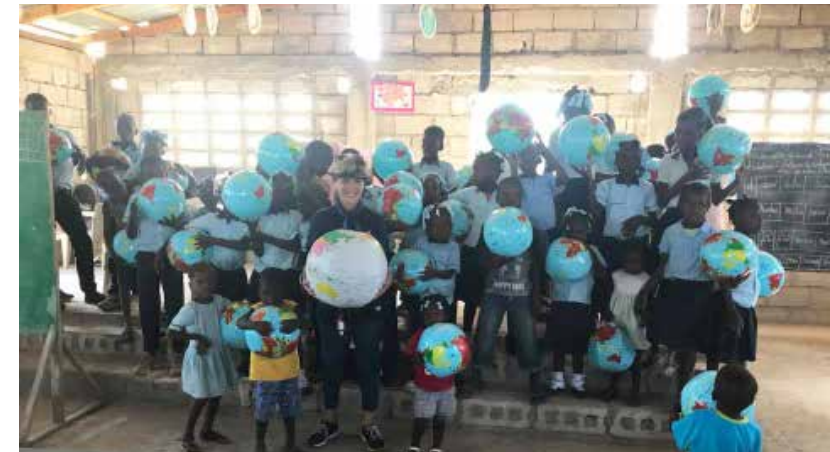
Students at the Colminy School got a geography lesson and a blow-up globe of their own.