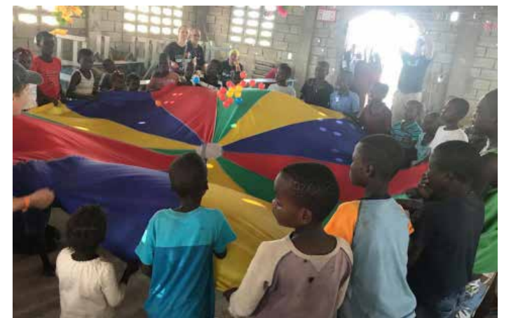
Mission team members take a break to have fun with the children in Colminy.