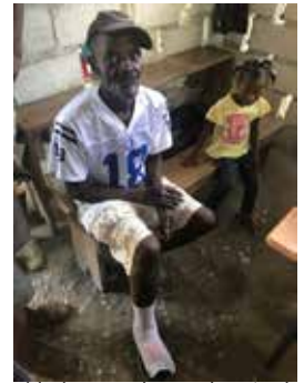
Elderly man who was baptized

during the second week and trained approximately 20 Haitian architects, engineers and construction professional in disaster-resistant construction. He certified four people to teach the course and a formal