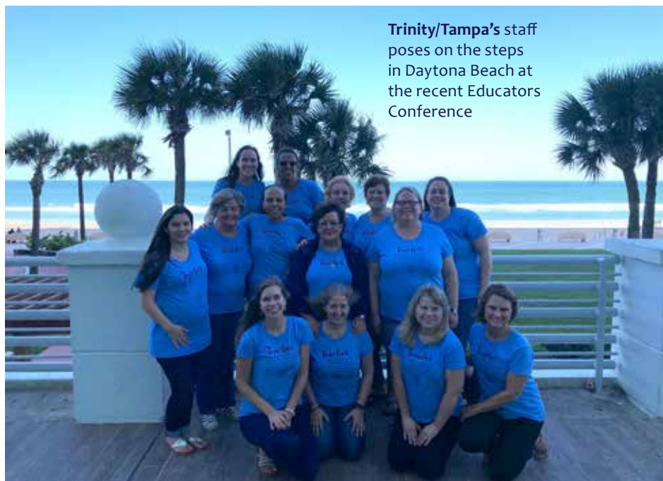
Trinity/Tampa’s staff poses on the steps in Daytona Beach at the recent Educators Conference