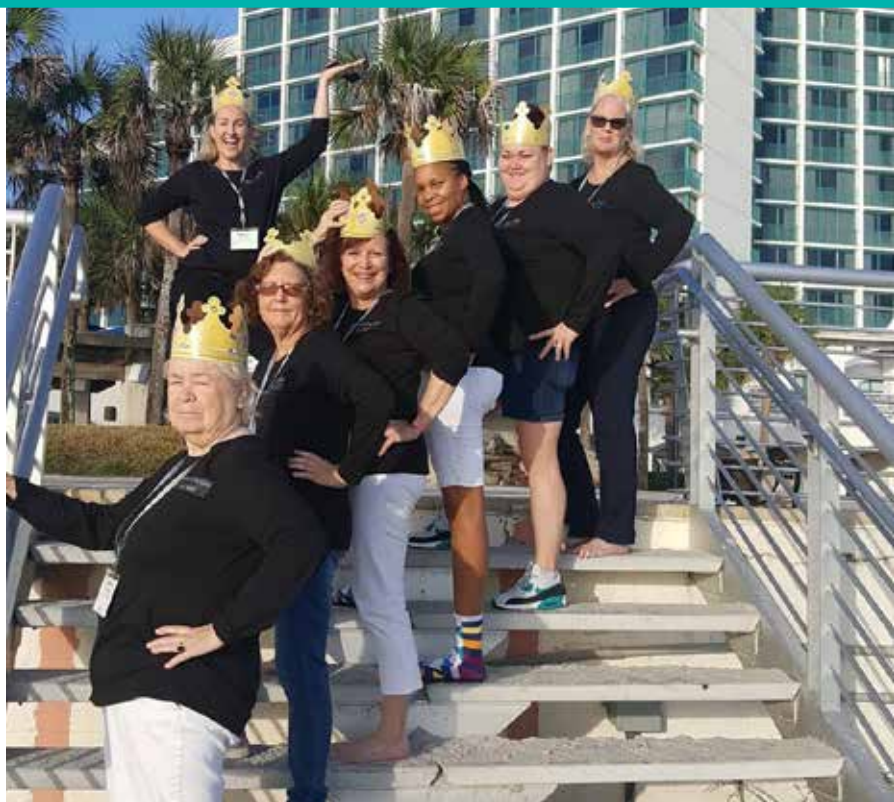
Queens of the Surf — Seven ladies — members of the faculty at Shepherd of the Coast/Fort Lauderdale — posed on the oceanfront stairs at the recent Florida-Georgia District teachers conference in Daytona Beach. ■