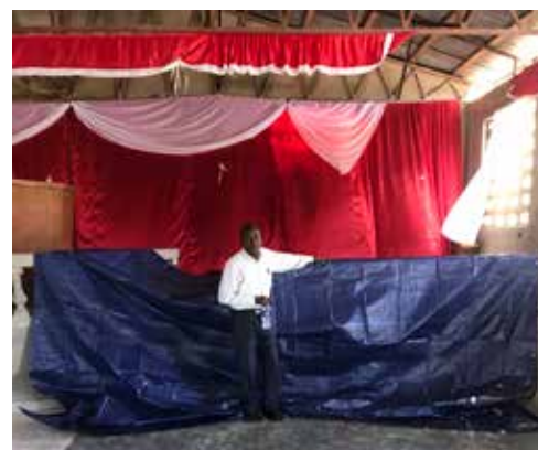
Right — More than 50 tarps were distributed to residents affected by the recent earthquake.