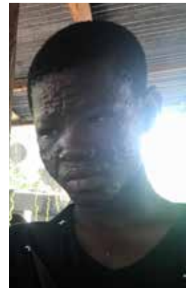
Young man with Leprosy