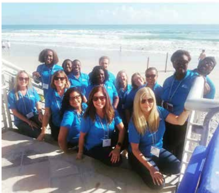
Holy Cross/North Miami (at left) takes a break between sessions at the recent Florida-Georgia District teachers conference in Daytona Beach. ■