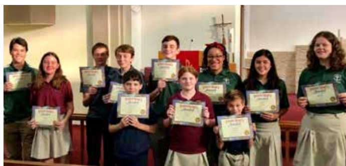
First/Clearwater, FL recognized their students achieving either honor roll or the principal's list during one of the chapel services last month. They also had a recent fund-raiser and spirit night at the Enterprise Road location of Chick-fil-a Restaurant. ■