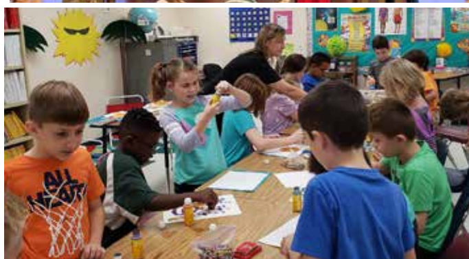
Our Savior/Saint Petersburg, Florida recently celebrated a Festival of the Arts on their campus with local artists providing a fun learning experience for their students. ■