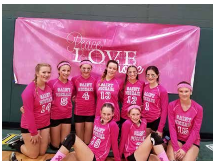
Saint Michael/Fort Myers, FL — The Varsity Volleyball team participated in a Kick Out Cancer Tournament benefiting Base Camp Children's Cancer Foundation. BASE Camp Children's Cancer Foundation provides a year-round base of support for children and families who are facing the challenge of living with cancer and other life-threatening hematological illnesses. ■