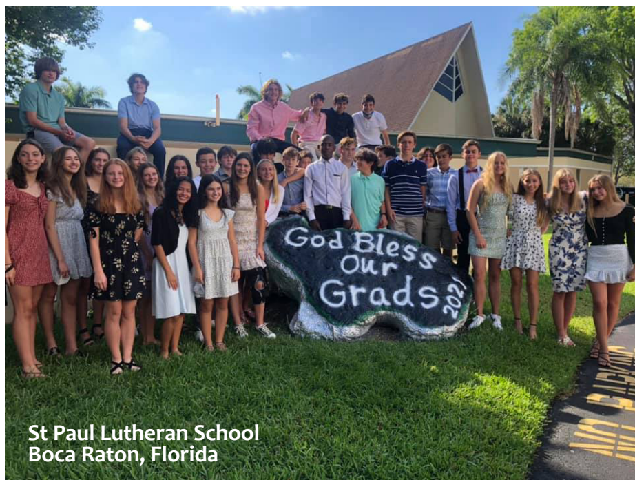
St Paul Lutheran School Boca Raton, Florida

Lutheran Schools are centers for service with faithful pastors and teachers helping the students learn how to serve the Lord. We are mission outposts for our communities. Giving our youth various opportunities to serve provides rich examples of servants following Jesus. We celebrate our Savior who was Sent to Serve . ■