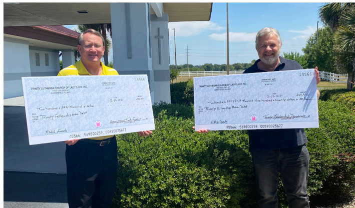
Photo above — some of the new members welcomed on Pentecost Sunday. At left — checks presented to pay off the congregation's mortgage. Below left — Trinity's own sound technician performs a magic trick. Below — the burning of the church's mortgage.