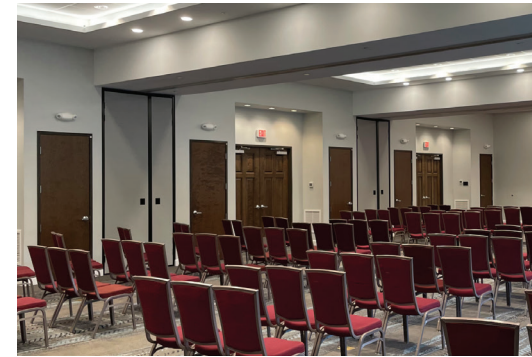
Conference Center Meeting Room