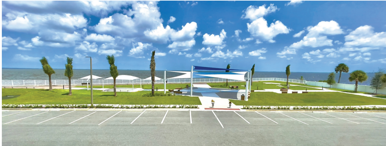
The outdoor gathering area has giant sails for shade and expansive river vistas

The St. Stephen Christian Retreat and Conference Center sits on the west bank of the Indian River in beautiful Titusville. The serene campus grounds include a swimming pool and abundant green space with shaded seating areas. Some of the breakouts meet “down by the riverside.”