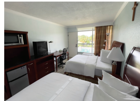
Clean & Comfortable Accommodations